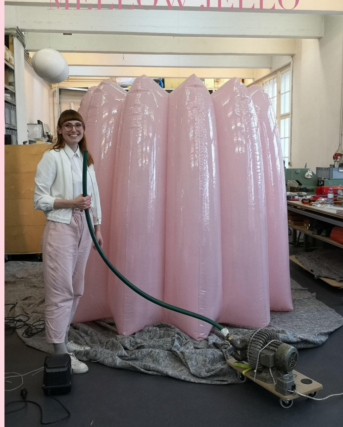
MELLOW JELLO ca. 200 x 200 x 200 cm, pvc, edition of 1, AT 2021 workshop snapshot taken shortly after finishing the last weld seam